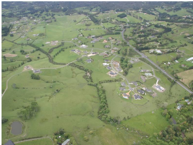
Stream Riparian Buffer as a Component of Subdivision Land Use

When considering riparian buffers, it is helpful to detail the variety of benefits that are gained by their protection or implementation. Riparian buffer systems provide the following benefits: