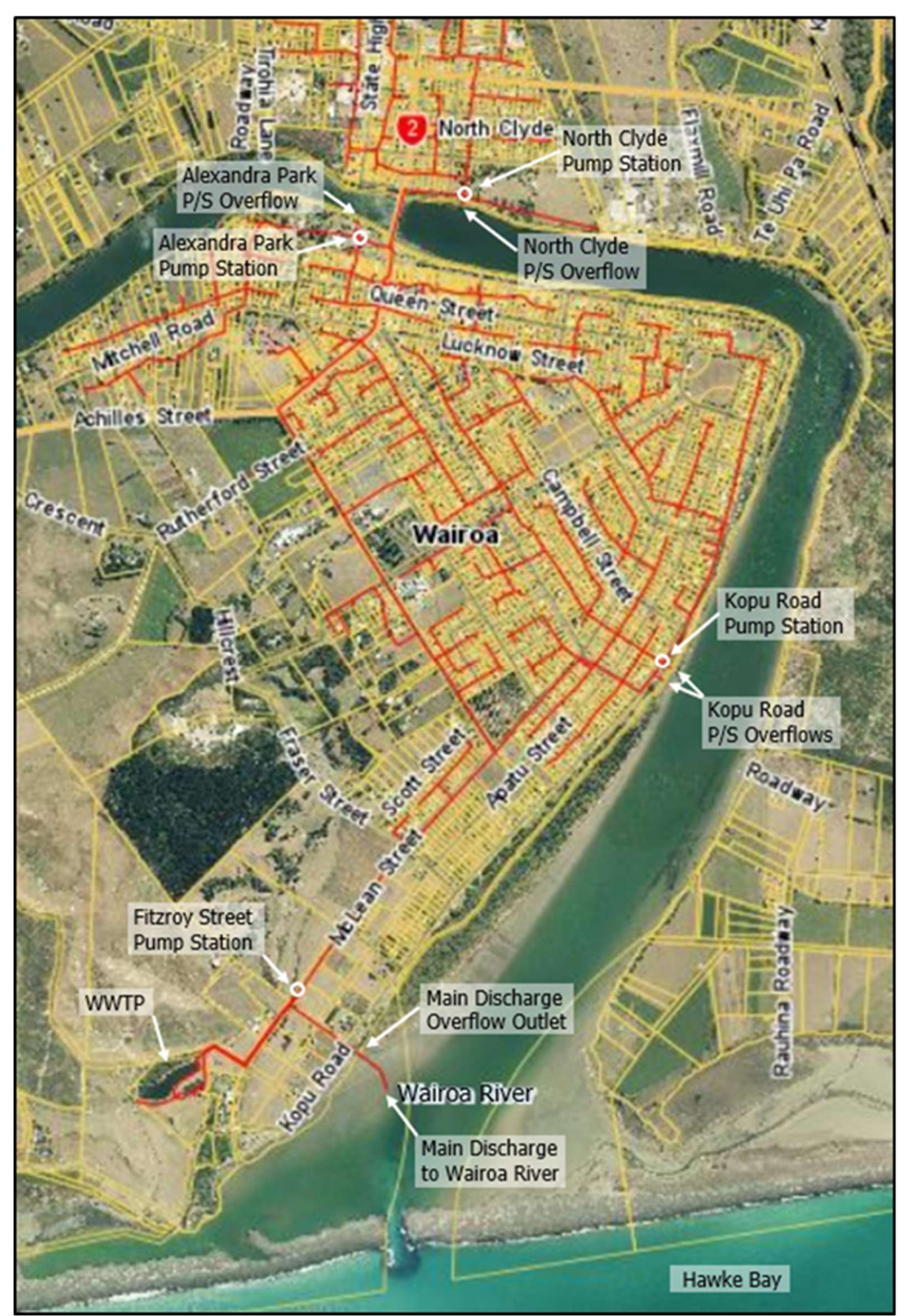
Plan of Existing Wairoa Pump Station and WWTP Discharge Outfalls