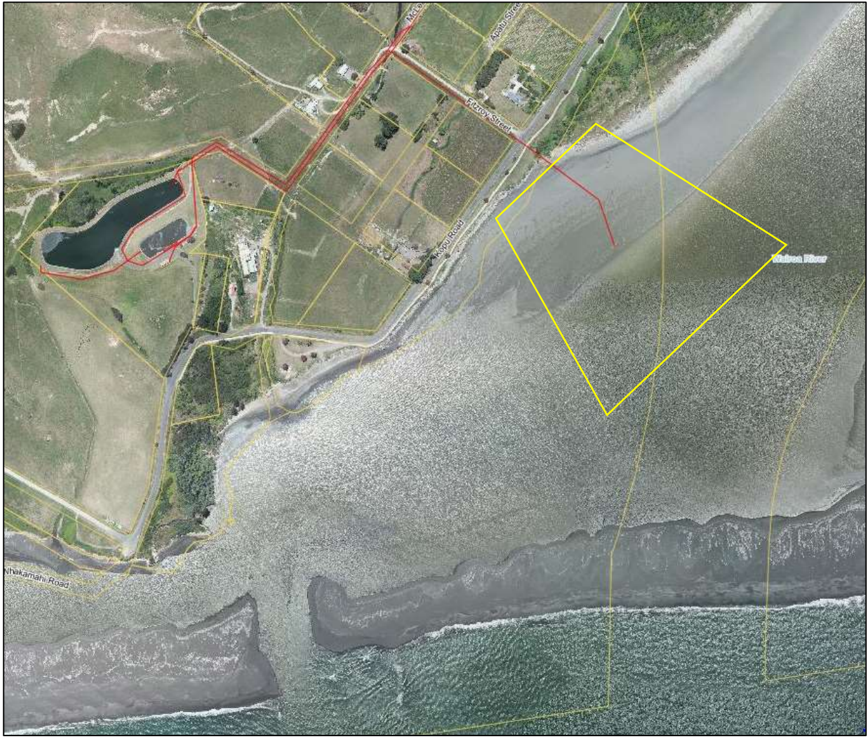
Plan of Wairoa WWTP Outfall Relocation Area for Future Modifications