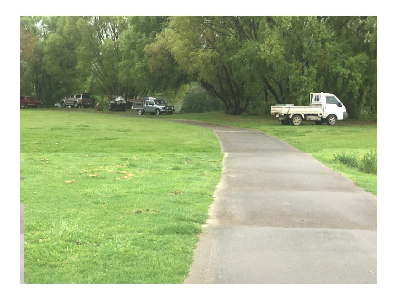
Figure 12. Photo: Tangata Whenua White Baiting and Fishing Kopu Road, Wairoa.