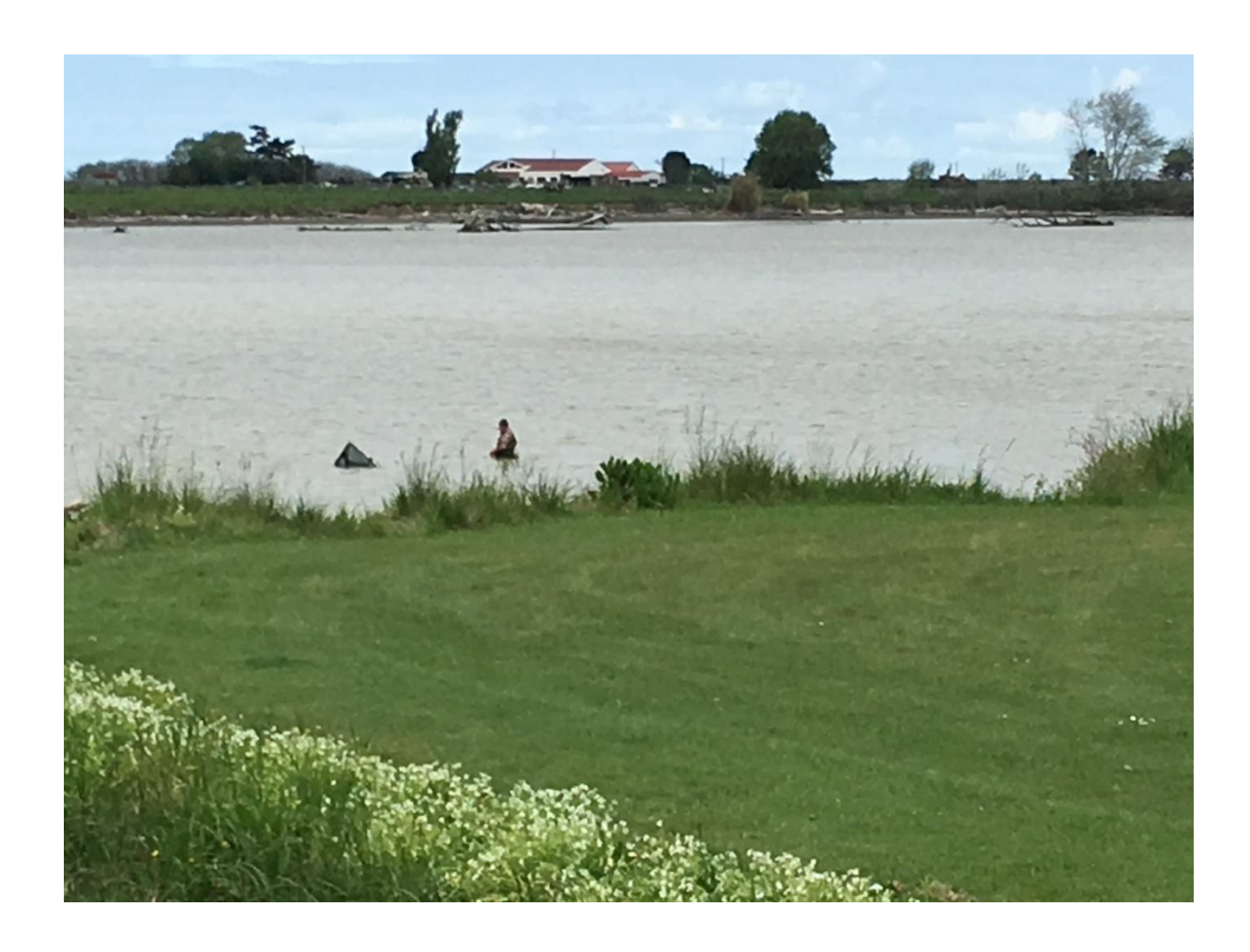
Figure 13. Photo: Tangata Whenua Net Fishing, Kopu Road, Wairoa.