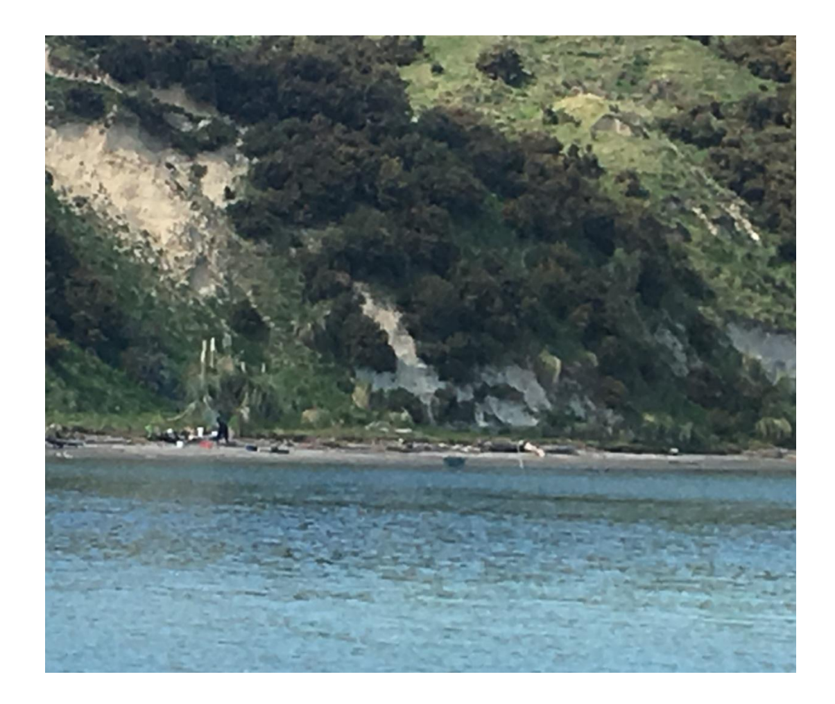
Figure 10. Photo: Tangata Whenua Checking Fishing Nets Kopu Road, Wairoa.