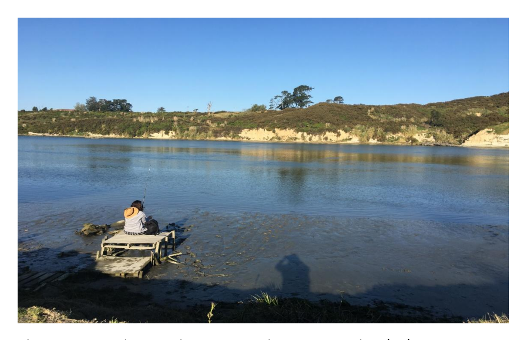
Figure 8. Photo: Tangata Whenua Fishing Kopu Road, Wairoa. Dated: 05/10/2019 Time: 5.34 p.m.