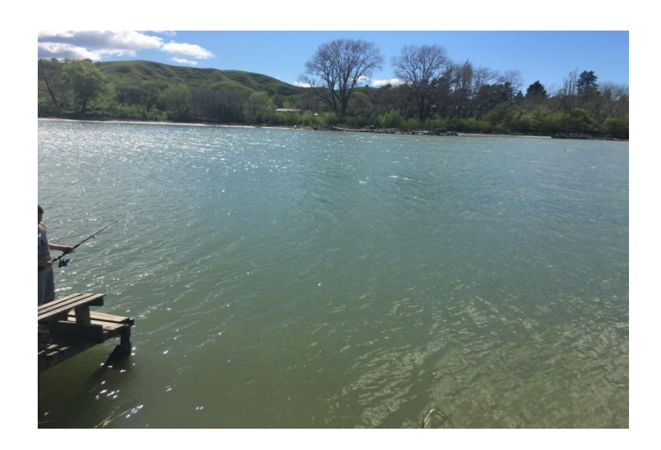
Figure 4. Photo: Tangata Whenua Fishing Kopu Road, Wairoa. Dated: 05/11/2019 Time: 11.20 a.m.