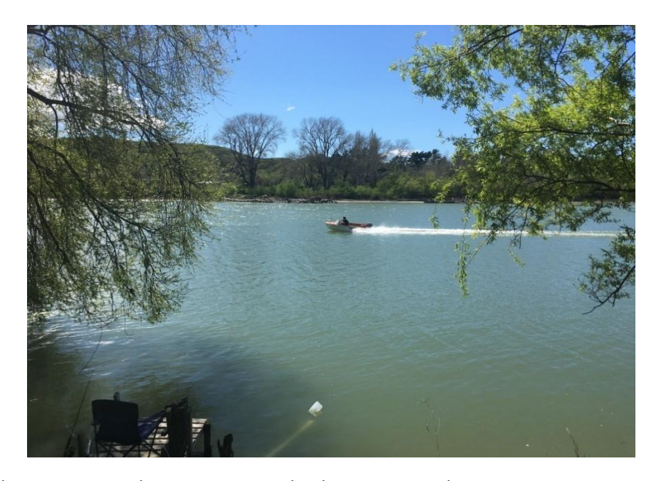
Figure 6. Photo: Tangata Whenua Boating and Fishing Kopu Road, Wairoa.