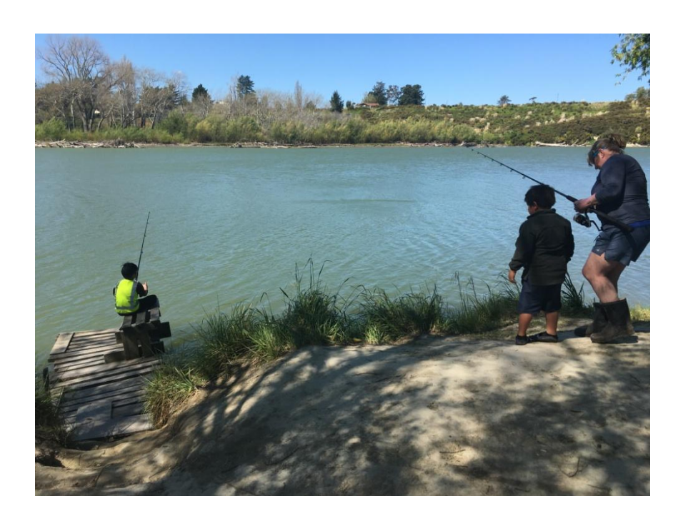
Figure 5. Photo: Tangata Whenua Fishing, Kopu Road, Wairoa. Dated: 05/10/2019 Time: 2.24 p.m.