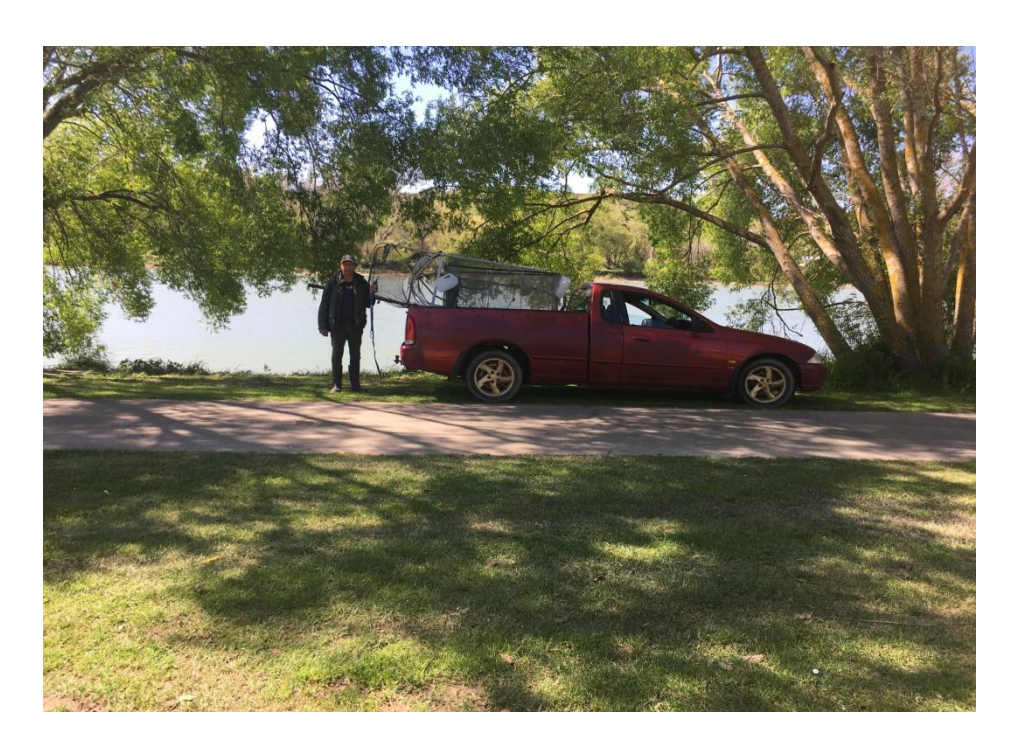
Figure 7. Photo: Tangata Whenua White Baiting Kopu Road, Wairoa. Dated: 05/10/2019 Time: 2.26 p.m.