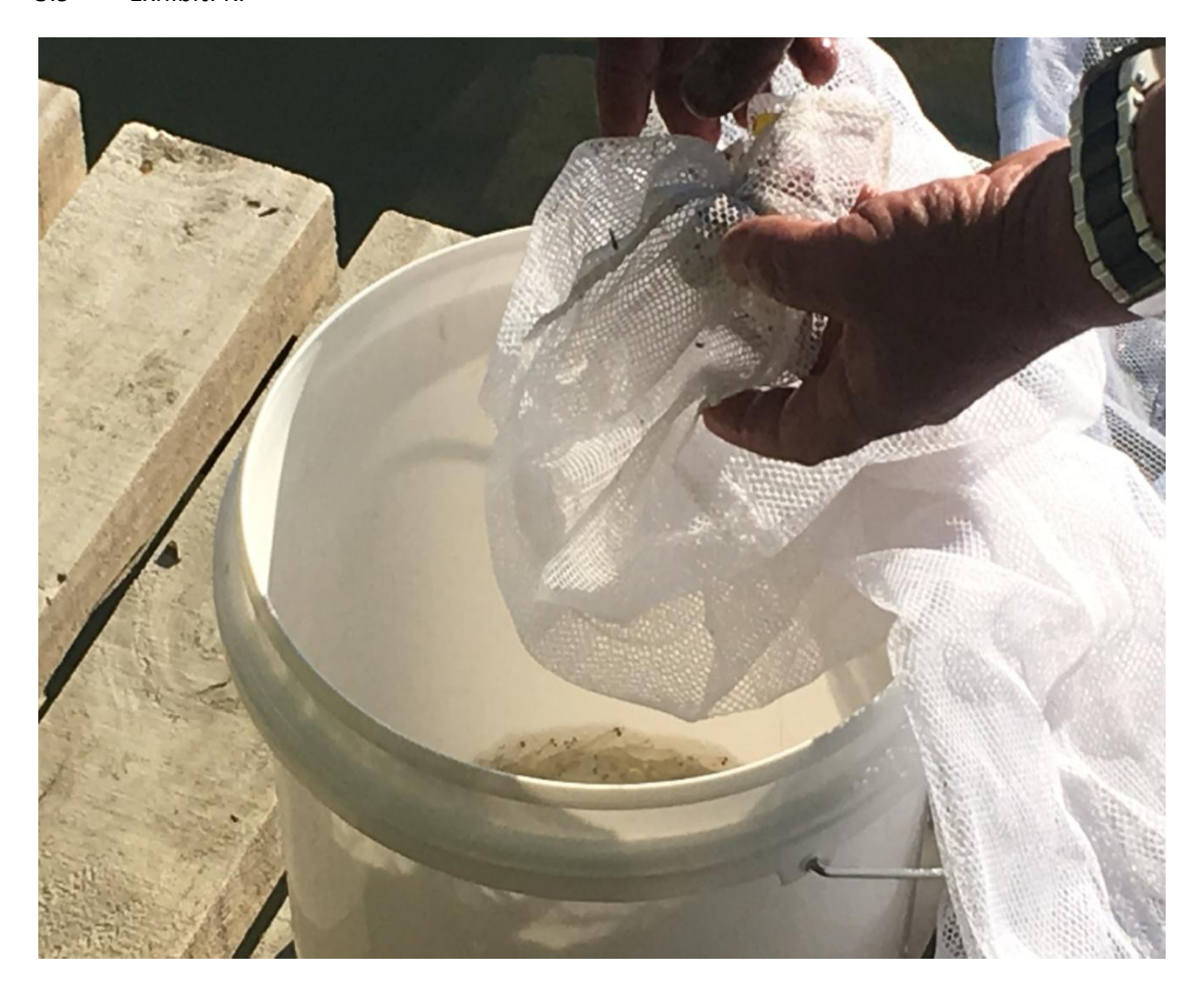
Figure 11. Photo: Tangata Whenua White Baiting, Kopu Rpad, Wairoa.