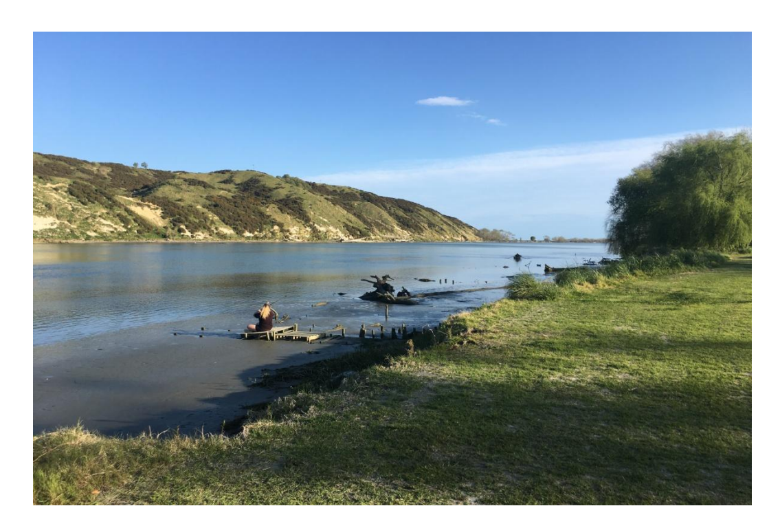
Figure 9. Photo: Tangata Whenua Fishing Kopu Road, Wairoa. Dated: 05/10/2019 Time: 5.24 p.m.