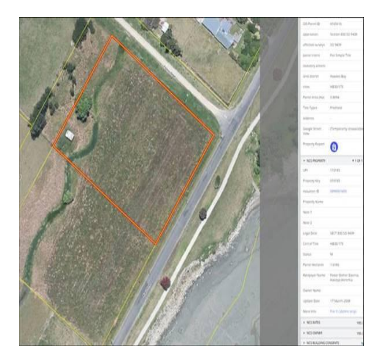
Figure 1. Block: Suburban section 830 – 0.08094 ha