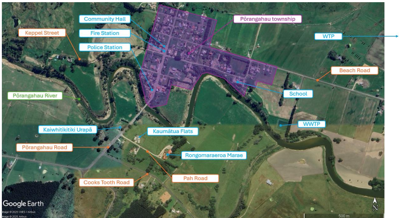
Figure 1 Key locations

The proposed scheme is intended to protect the township of Pōrangahau. In addition to this urban core there are other key locations that are discussed below which are of relevance. Figure 1 shows these locations.