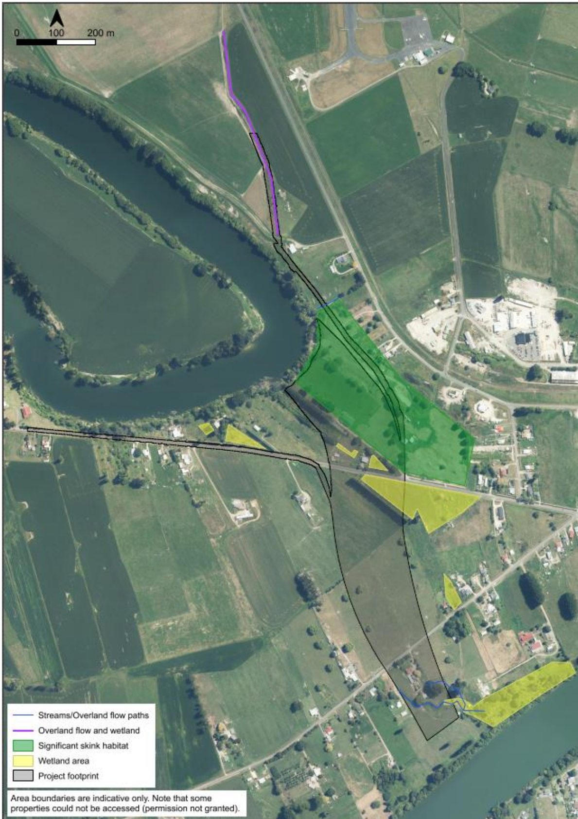
Figure 3. Extent of streams (blue) and overland flow paths (purple), natural inland wetlands (yellow) and significant skink habitat (green) within the project footprint of the Wairoa Floodway. Note that the wetlands have not been delineated so the boundaries are only indicative.