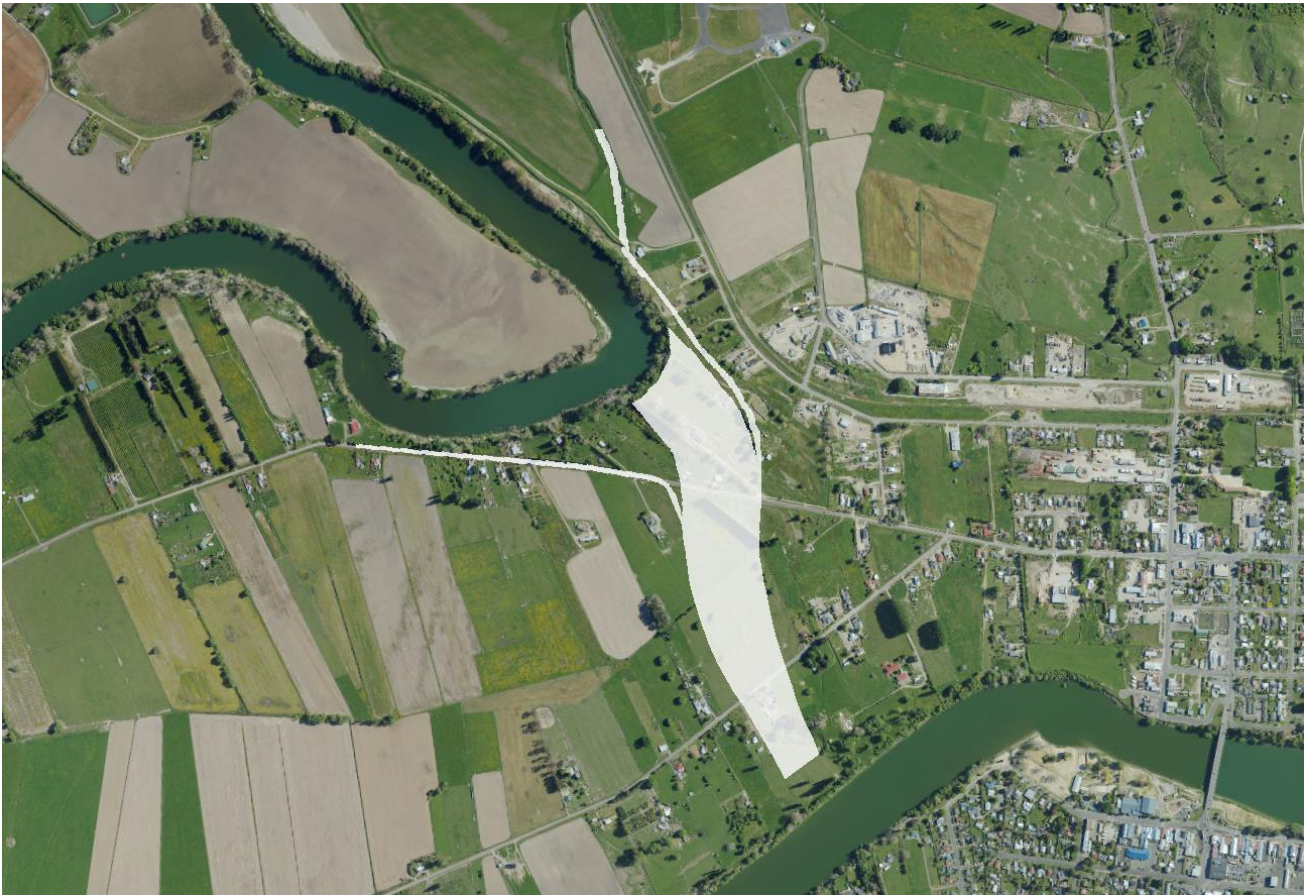
Figure 1: Approximate floodway alignment.

The floodway will be constructed through the inner ‘peninsula’ of the greater Wairoa meander. The floodway inlet starts on the true left of Wairoa River, between Railway Road and Ruataniwha Road (Figure 1). Construction will involve stripping the majority of existing vegetation within the floodway corridor, followed by re-establishment of grass cover. In addition, the alignment of Ruataniwha Road near the floodway will be modified, and a stopbank will be constructed along the floodway boundary.