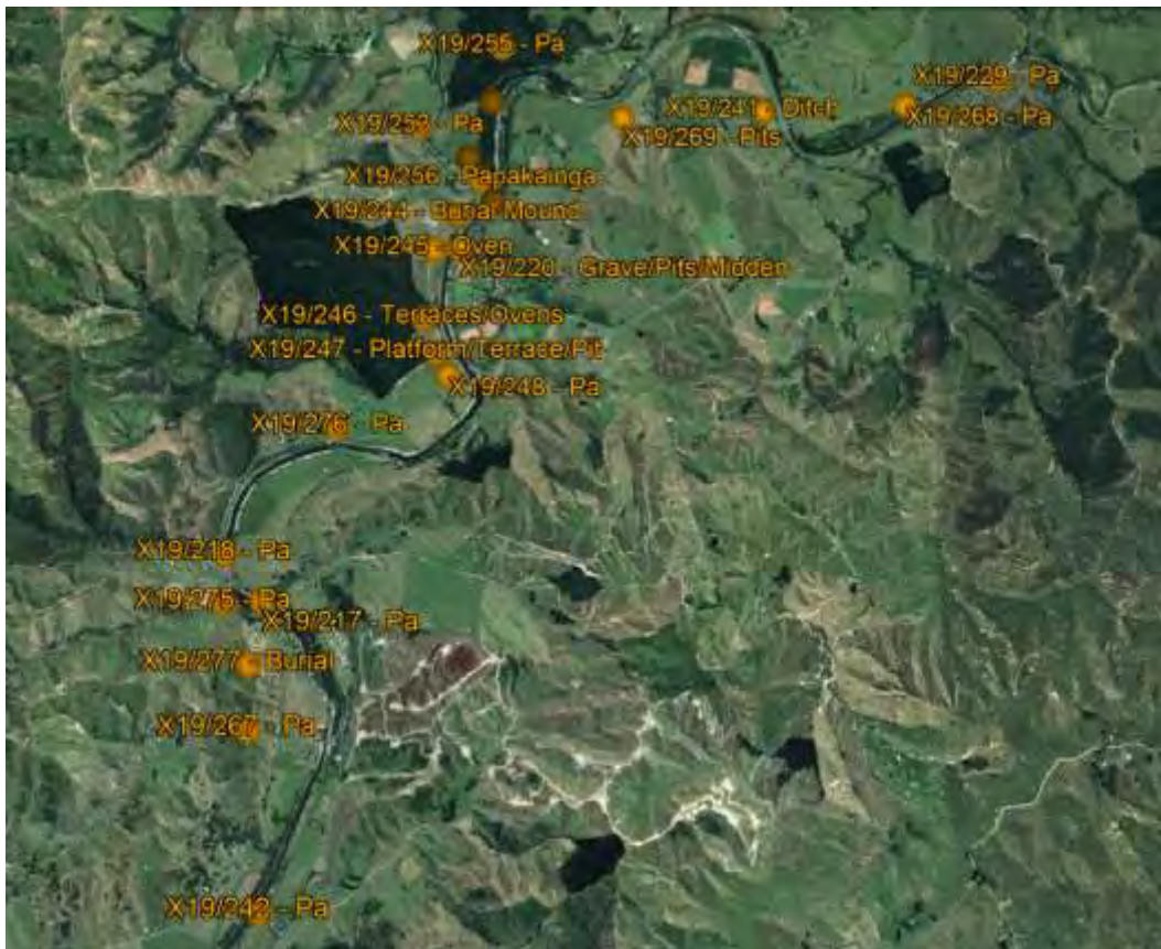
Figure 3: Archaeological sites north of Frasertown