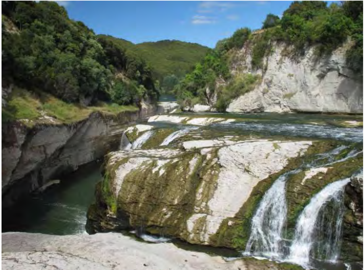
Te Reinga Falls