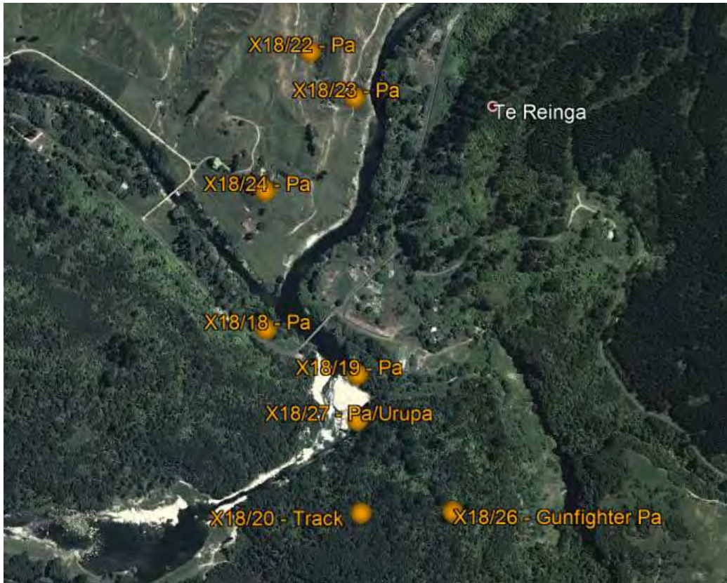
Figure 4: Archaeological sites around the junction with the Ruakituri and Hangaroa Rivers