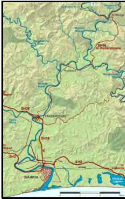
Figure 1: Wairoa River