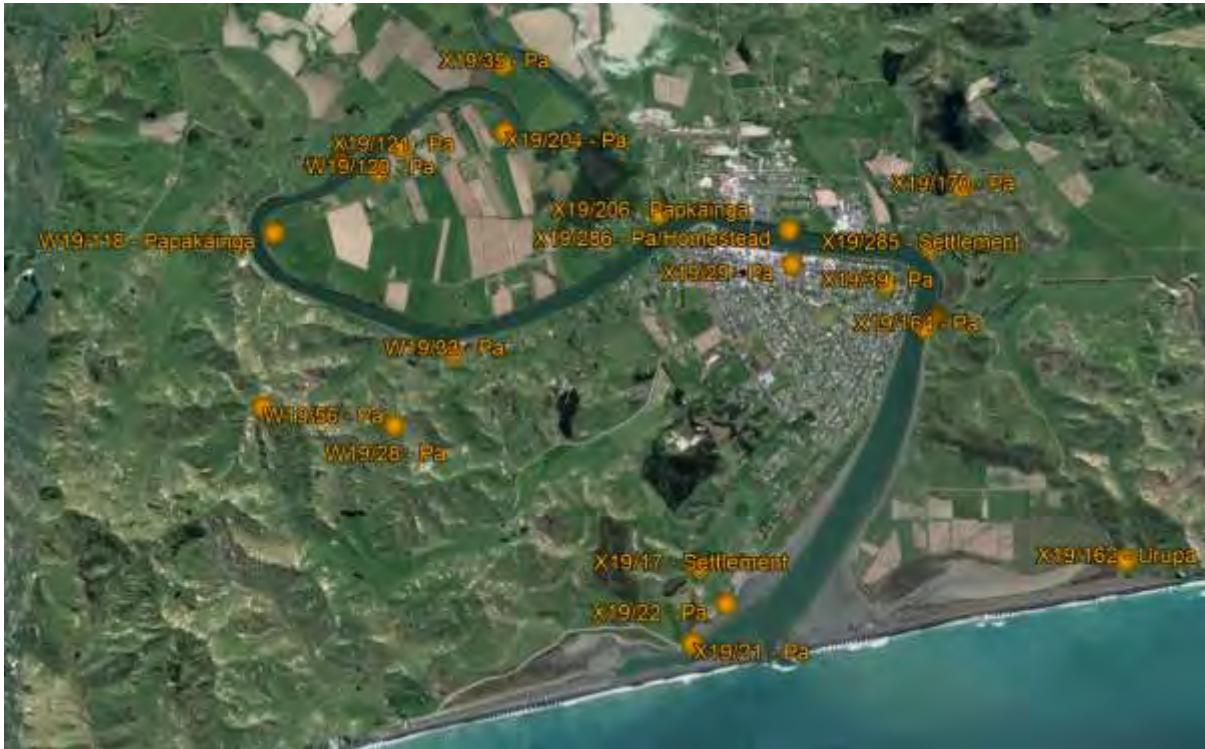
Figure 1: Archaeological sites around Wairoa township and the river mouth

The Wairoa River has a large number of registered archaeological sites along its banks and in the adjacent hills. The images below do not show the many pits, terraces and platforms that are recorded.