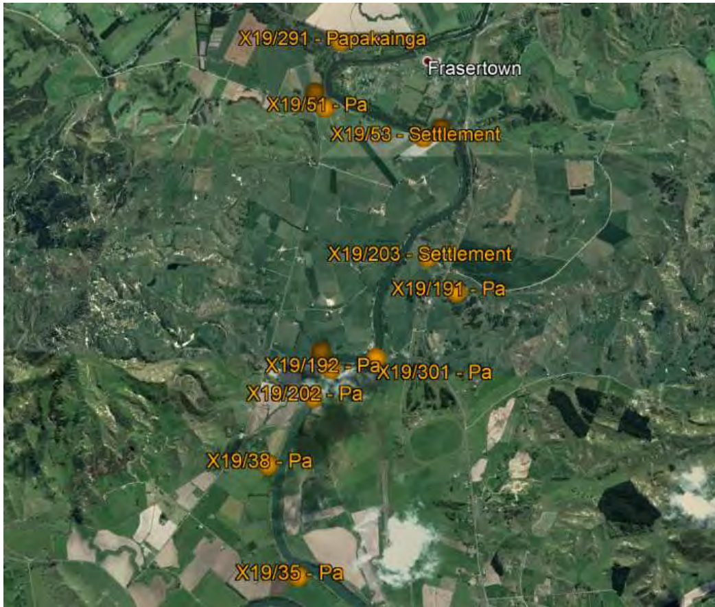
Figure 2: Archaeological sites between Wairoa and Frasertown