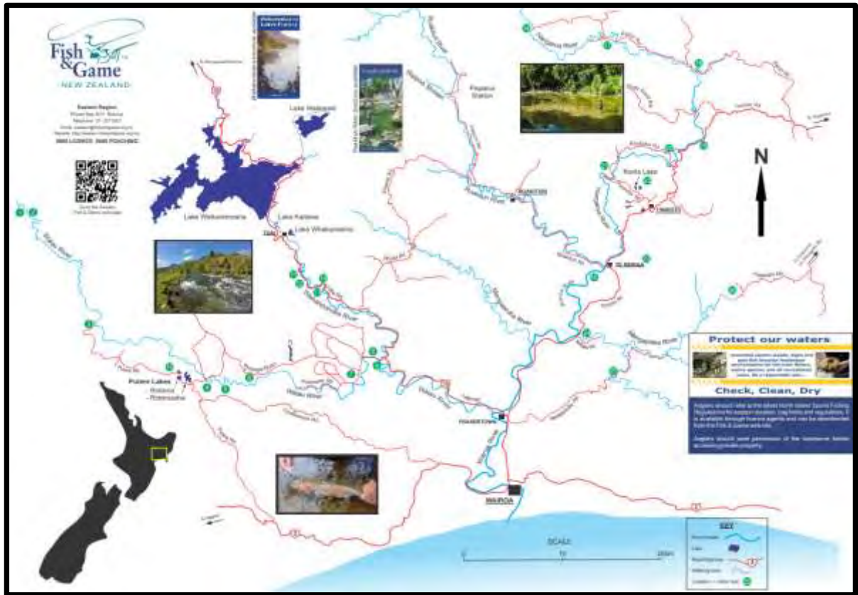
Wairoa River and tributaries