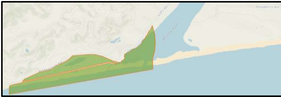
Figure 3: Whakamahi Wildlife Management Reserve