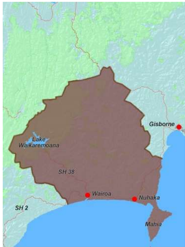
Figure 5: Te Rohe o Wairoa Area of Interest