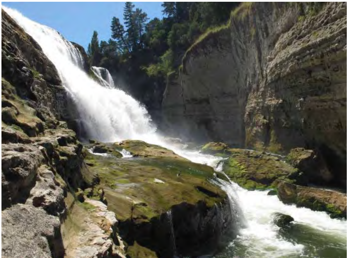
Te Reinga Falls