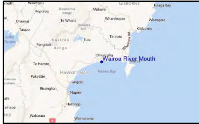
Figure 2: location of Wairoa River