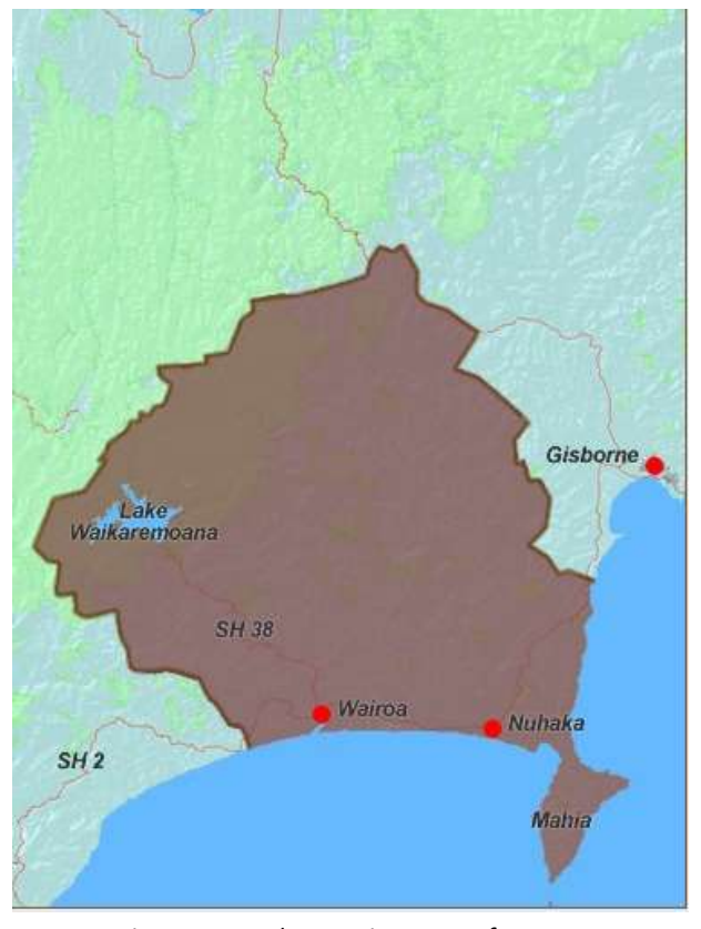
Figure 5: Te Rohe o Wairoa Area of Interest