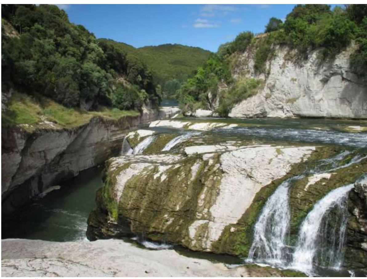
Te Reinga Falls