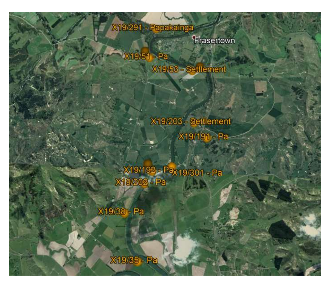
Figure 2: Archaeological sites between Wairoa and Frasertown