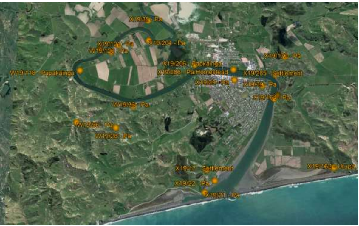
Figure 1: Archaeological sites around Wairoa township and the river mouth

The Wairoa River has a large number of registered archaeological sites along it's banks and in the adjacent hills. The images below do not show the many pits, terraces and platforms that are recorded.