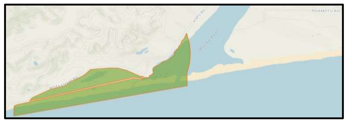
Figure 3: Whakamahi Wildlife Management Reserve