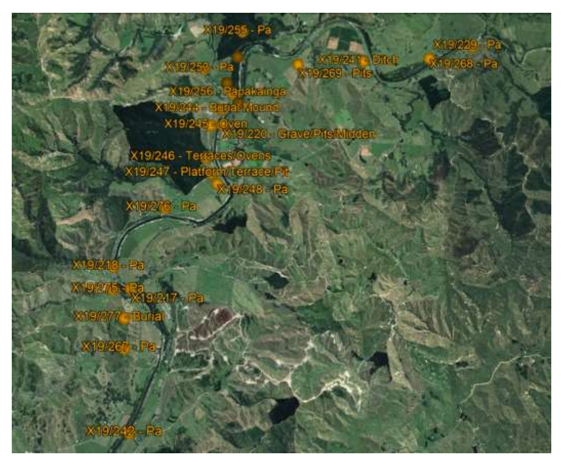
Figure 3: Archaeological sites north of Frasertown