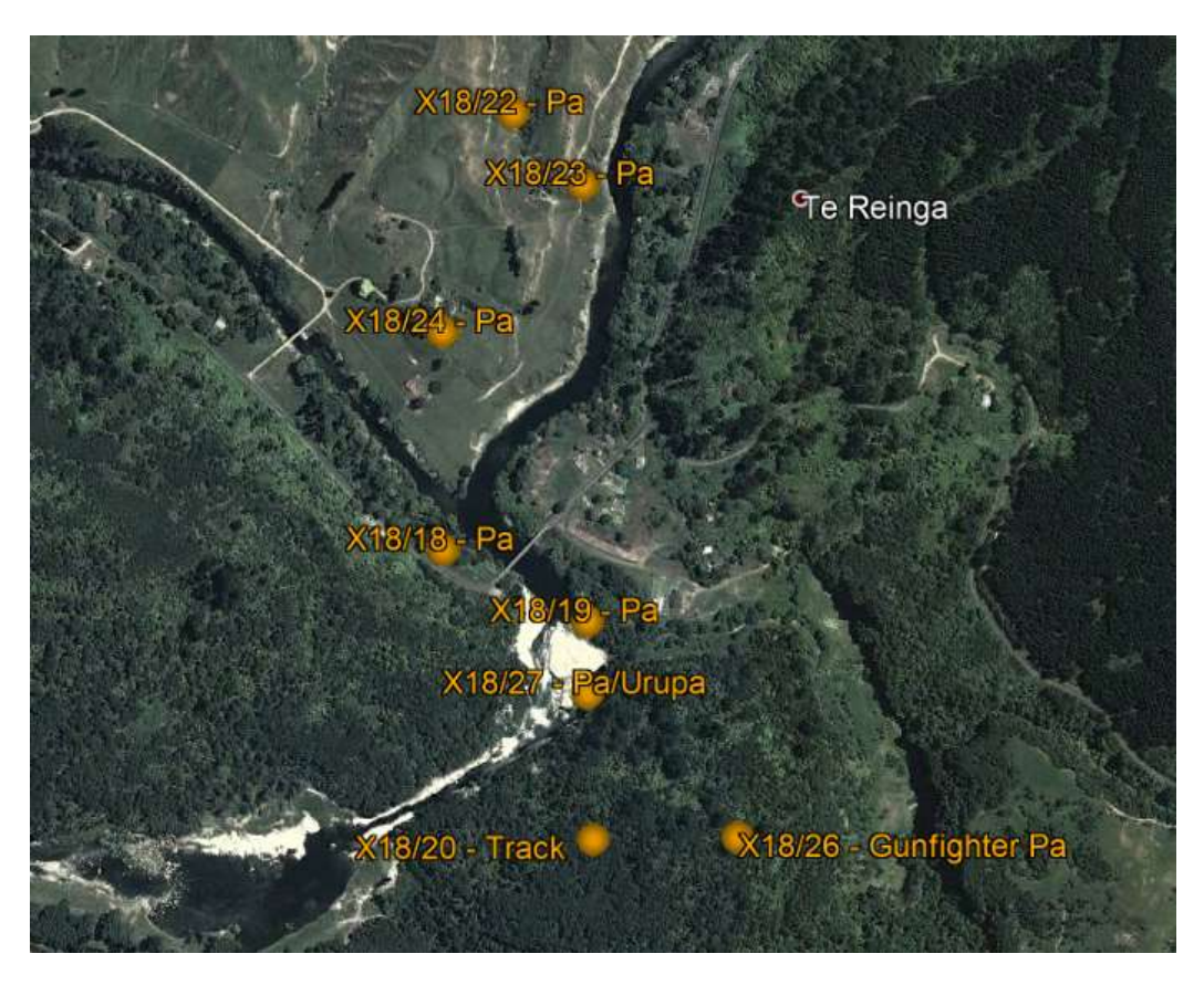
Figure 4: Archaeological sites around the junction with the Ruakituri and Hangaroa Rivers