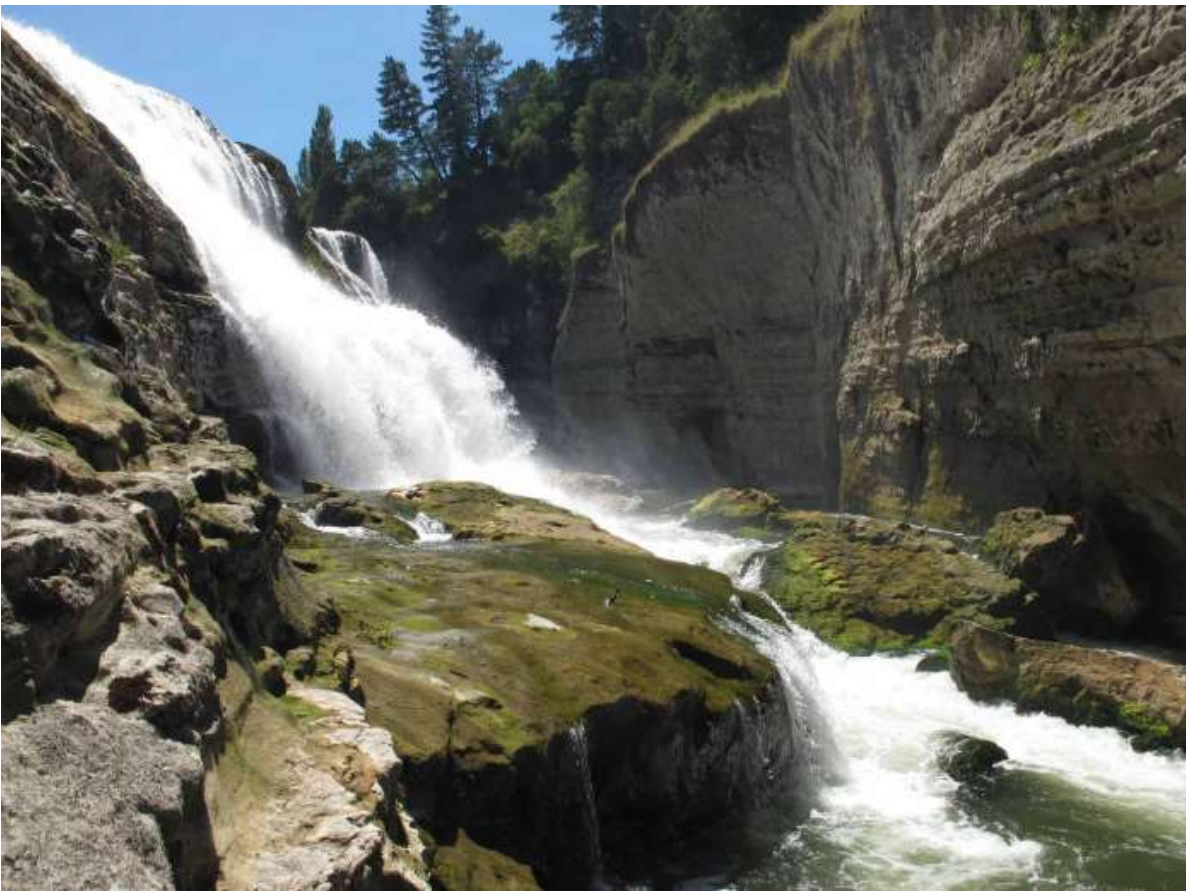
Te Reinga Falls