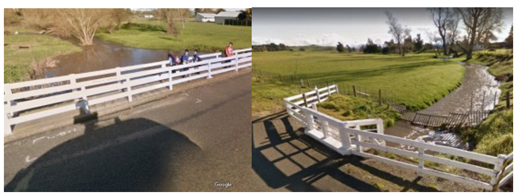
FIG. 3 FIG. 4.

FIG 4 Paritua Stream. Rare sight of stream flow from the Paritua into the Karewarewa.