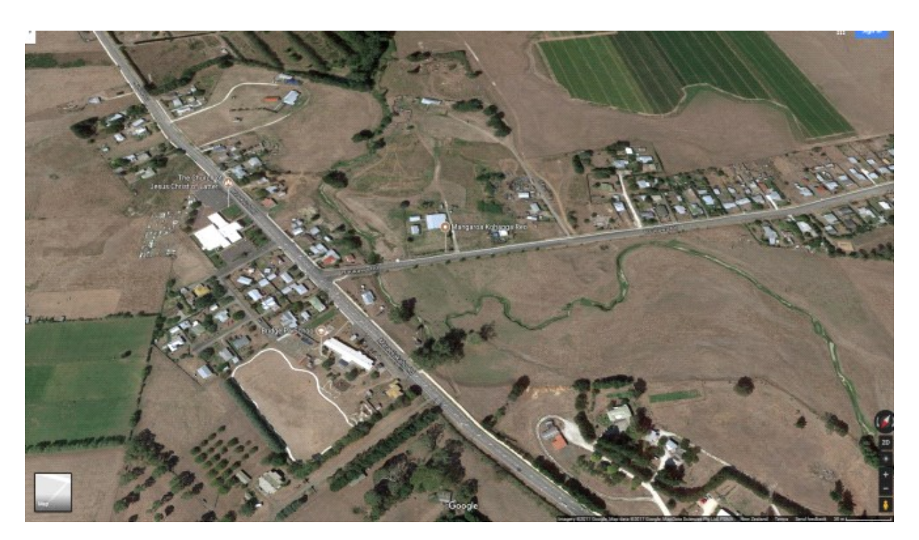
FIG: 1. Bridge Pā Community. The 'Green' lines shown in the paddock are (T) The Karewarewa (FIG. 3.) and the (B) The Paritua (FIG. 2, 4.). Maraekakaho and Raukawa Roads intersections signals the change of the streams' from Karewarewa into Paritua.