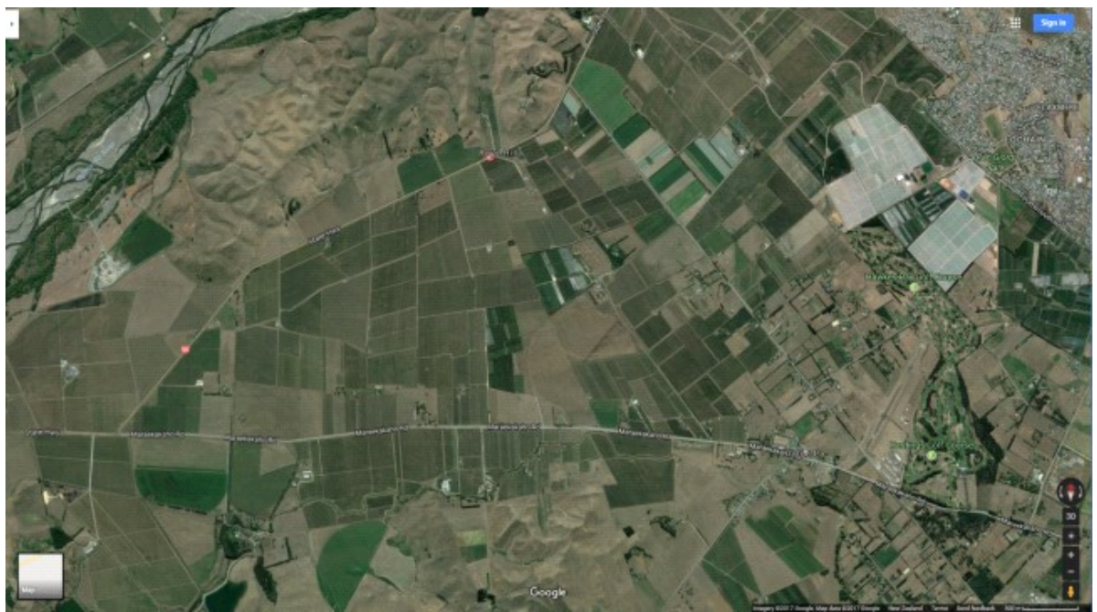
FIG. 6. A 18 kilometre 'triangle' – Bridge Pā Triangle, one of New Zealand's fastest growing wine regions. (<a href="www.bridgepatriangle.nz">www.bridgepatriangle.nz</a>) On the top left corner is the Ngaruroro River, one of the three main arteries in the TANK catchment. The bottom half is the Paritua/Karewarewa Streams meandering through one part of the Bridge Pā Triangle heading towards the Ngatarawa Valley.